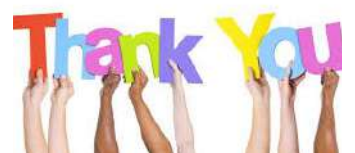
Thank You from Core!

work and community spirit that is still ever present at Core.