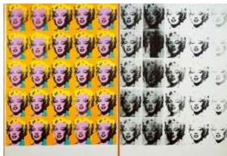
Andy Warhol at the Tate Modern in London.

you want to us to share your work on all of our platforms, do let your Membership Manager know too.