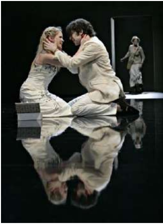
A Midsummer Night's Dream (2005), directed by Gregory Doran.

“The course of true love never did run smooth.”