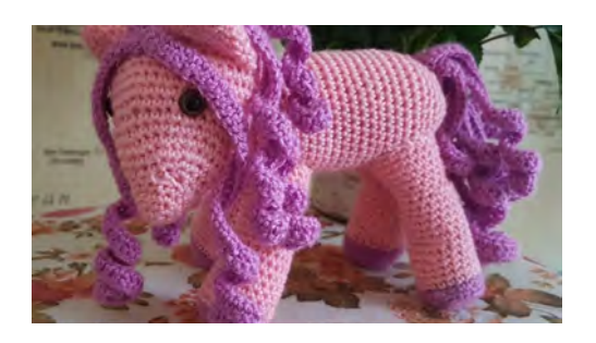
Crochet creation by Irina